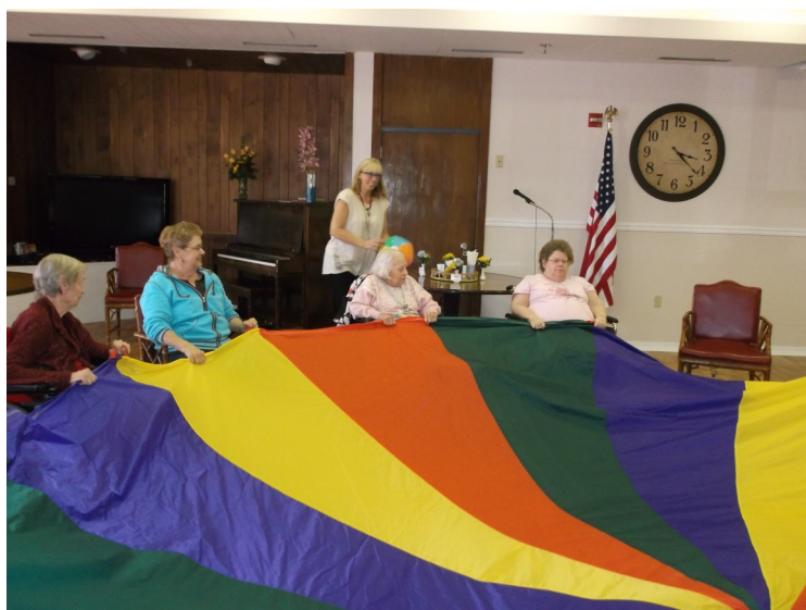
Parachute Exercises! Who said exercise is not fun?